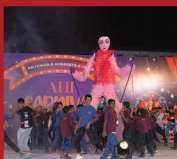
Glimpses from the AHI Carnival