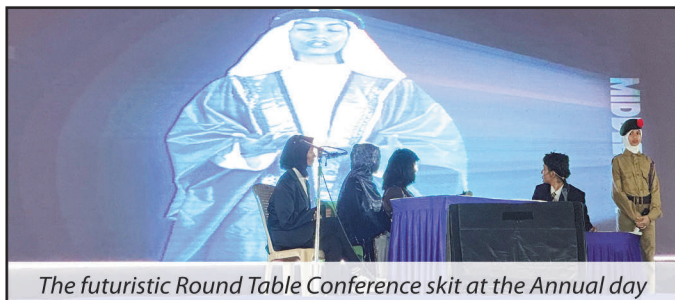
The futuristic Round Table Conference skit at the Annual day

January began with the Principal meet and PTM, aligning goals across faculty and parents. The Integrated Annual Day on 11th Jan 2025 dazzled with music and drama, while the Projects Exhibition showcased student innovation. On Republic Day, a World Record was set for plastic awareness.