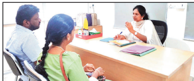
Family centered parental therapy

journeys. Structured exit interviews here have become reflective tools that help institutional strategies, ensuring parents feel supported and heard.