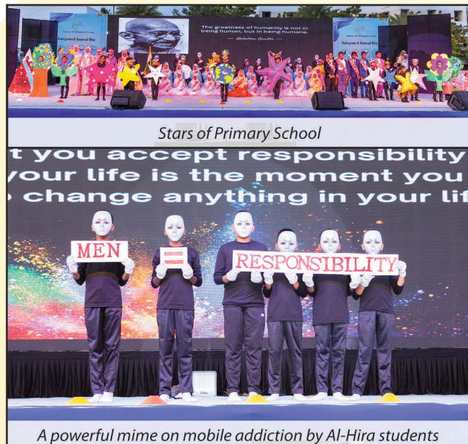
Stars of Primary School

Anjuman Primary School's "A Space-Time Odyssey", was a vibrant fusion of science, culture, and values. As students embodied celestial objects, they celebrated India's diversity, highlighted men's responsibility and championed women's empowerment. The majestic appearance of UY Scuti served as a humbling reminder of our small place in the universe. The finale highlighting ten timeless values, left a lasting impression, encouraging empathy, kindness, and purpose and resonating deeply with the audience -