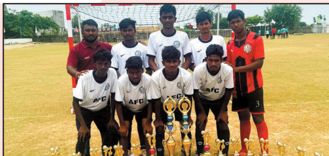
Dacal school participants at the Athletic Meet in Nehru stadium

From November 2024 to April 2025, the educational institutions at AHI experienced a vibrant period of sports activities that promoted teamwork, discipline, and excellence across all age groups.