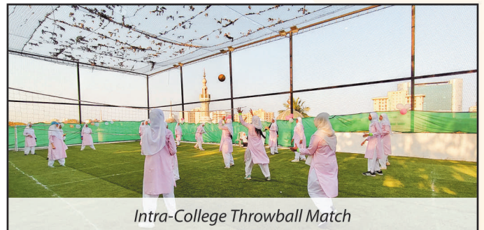
Intra-College Throwball Match