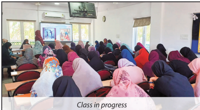
Class in progress

AHI Academy for Women is delighted to share the highlights of activities and achievements from Nov 2024 to April 2025. This period has been filled with exciting events, workshops, and milestones that showcase the Academy's commitment to academic excellence and community building.