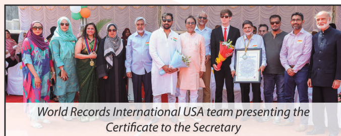
World Records International USA team presenting the Certificate to the Secretary

The Republic Day celebration on 26th January 2025, was a highlight of the Academic year, uniting students and staff from the Primary Wing, AMHSS, Al-Hira, DACAL, and the Academy. The event featured a grand parade, cultural performances, and a special assembly to honor the nation. Notably, the schools participated in a World Record attempt certified by World Records International USA, to raise awareness about no plastic usage, reflecting their commitment to environmental stewardship. The celebration fostered unity, patriotism, and a collective sense of pride among the entire school community.