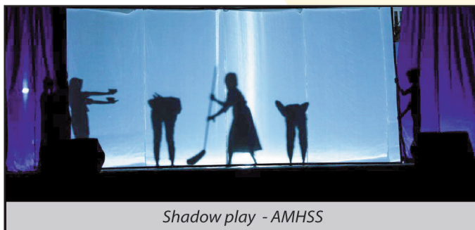
Shadow play - AMHSS

The Integrated Annual Day Program organised after a long hiatus, by the newly constituted AHI Cultural Committee, was a creative extravaganza featuring spectacular performances by the students of all the educational units of AHI, namely AHI Academy, Al-Hira, DACAL and Anjuman Primary & Higher Secondary School. The committee left no stone unturned in putting up a state-of-the-art open-air theatre, within the AHI campus, for the event which was well-attended and appreciated by over 3000 students and parents. The dedicated efforts of the teachers and the extraordinary talents of the students was evident in the mesmerising performances, the unique program ideas, and elaborate costumes, which left the audience spellbound and asking for more. The event was inaugurated by the President, Janab Mecca Rafeeqe Sahib and spanned over four hours with a break for tea and maghrib salah.