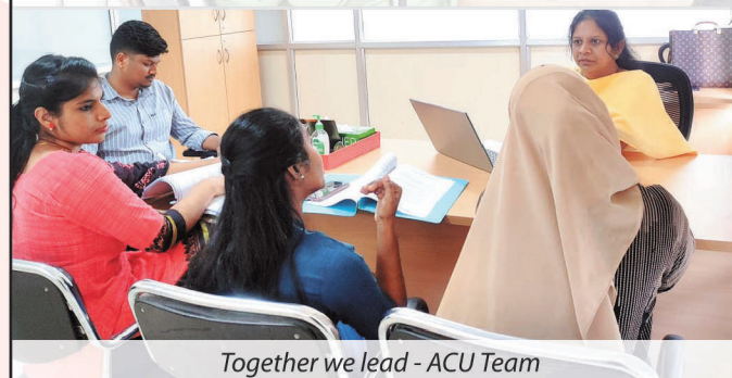
Together we lead - ACU Team