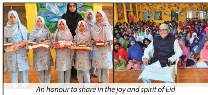
An honour to share in the joy and spirit of Eid