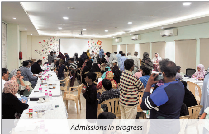
Admissions in progress

On 28th February 2025 information sheets and application forms were distributed.