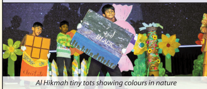
Al Hikmah tiny tots showing colours in nature

Al-Hira's theme on "Holistic harmony - cultivating mindful excellence through essential life skills," successfully celebrated students' talents. Their session began with a spiritual recitation. Diverse cultural performances followed, conveying social messages. Kindergarteners shared heartwarming tributes to parents, while a high school student delivered a TED Talk on volunteering. Primary students performed a