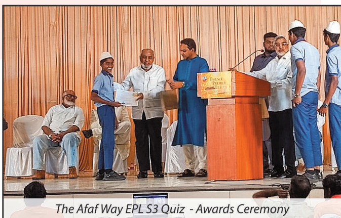
The Afaf Way EPL S3 Quiz - Awards Ceremony

NEET and JEE coaching, and participation in sports and art continued. Three of our boys were selected in the RSP contingent for the State Republic Day parade, while many others went on to compete in other district and state level in sports.