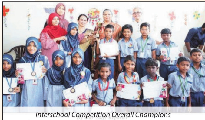
Interschool Competition Overall Champions