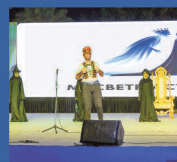
The Integrated Annual Day Program