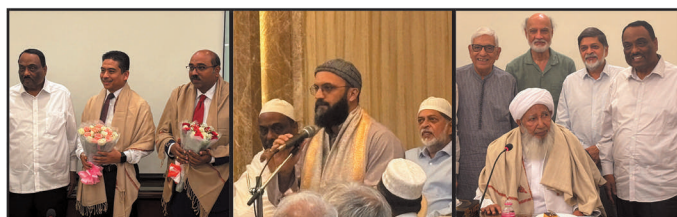
Distinguished Visitors with AHI members