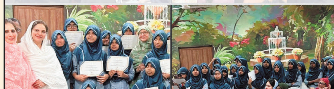
Fashion Designing & Home Nursing Course Completion Certificates Distribution Class XI & Class IX girls