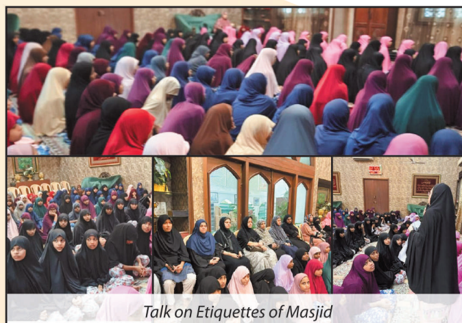
Talk on Etiquettes of Masjid