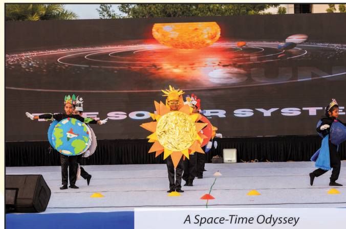
A Space-Time Odyssey

the stage, each one contributing to a truly synchronised and memorable session which was met with roaring applause from the audience.