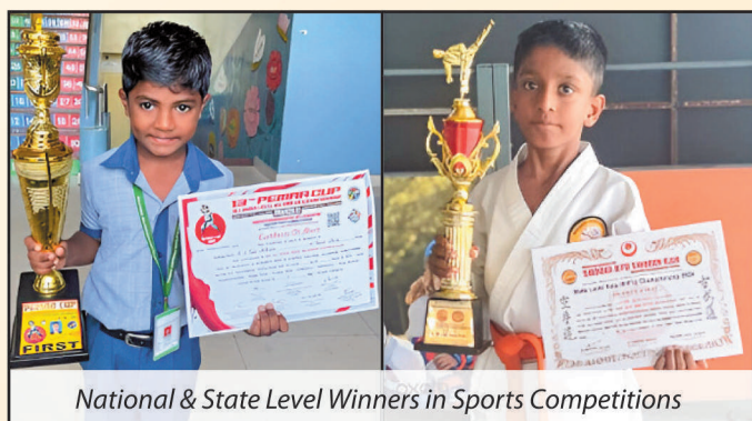
National & State Level Winners in Sports Competitions

Mini Marvels Talent Hunt at Our Lady's International School – Holy Angels: 7th December 2024 - Seventeen students participated in various activities, such as fancy dress, coloring, and singing. Seven students won medals.