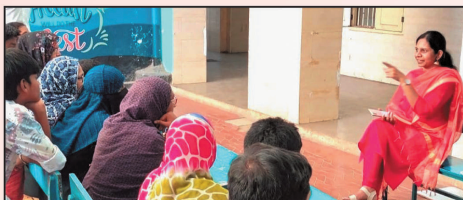
Parental Exit interviews - Boys Home