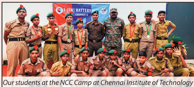
Our students at the NCC Camp at Chennai Institute of Technology

From November 2024 to April 2025, the educational institutions at AHI experienced a vibrant period of sports activities that promoted teamwork, discipline, and excellence across all age groups.