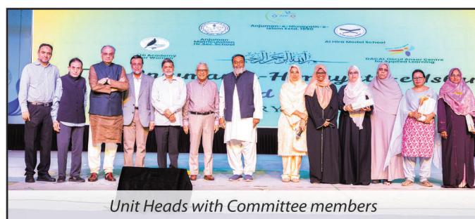
Unit Heads with Committee members

Tamil skit on plastic pollution, and another group presented an English skit on knowledge vs wisdom. Middle schoolers enacted a powerful mime on mobile addiction, and high schoolers performed a street play addressing social media hazards. The program effectively showcased student achievements and strengthened community bonds.