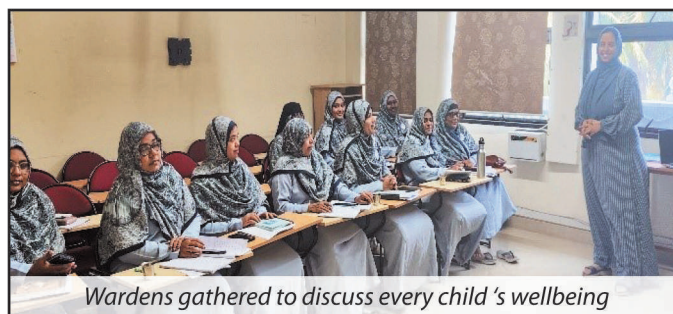
Wardens gathered to discuss every child's wellbeing