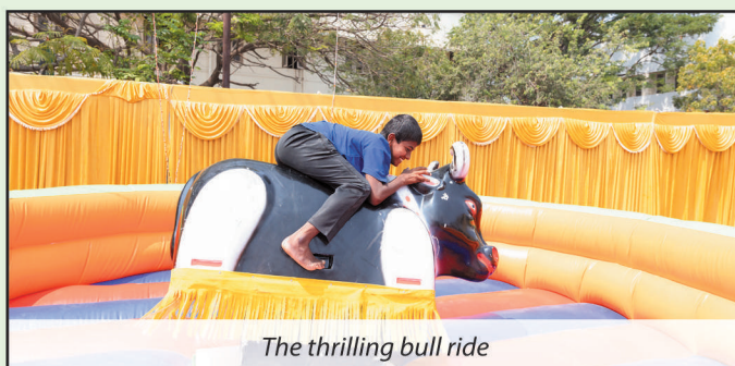
The thrilling bull ride