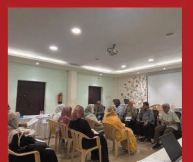
AHI-Homes Admission Begins