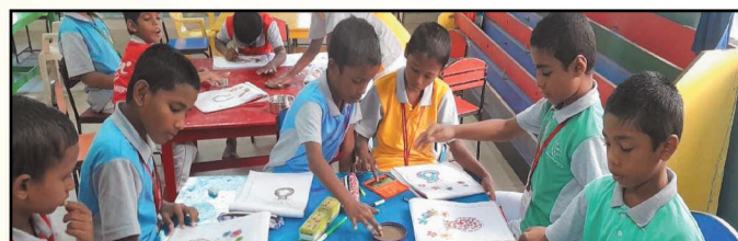
Thumb Print-Class V