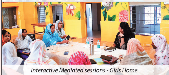
Interactive Mediated sessions - Girls Home