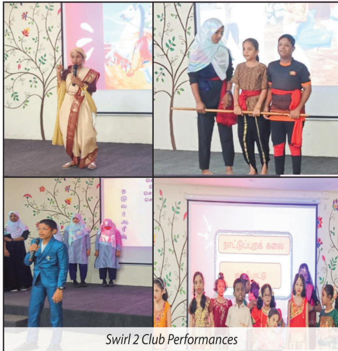
Swirl 2 Club Performances