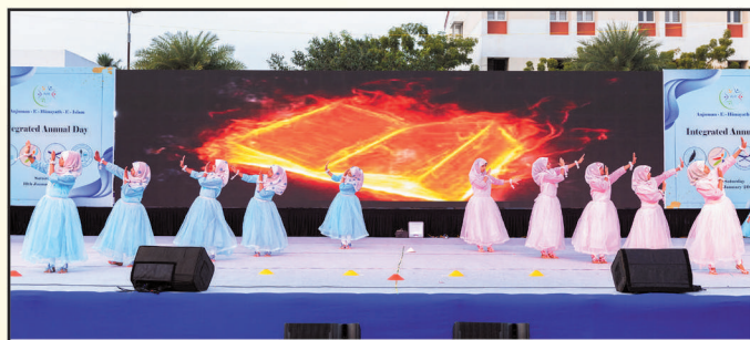
Al-Hira students' captivating performance - Creations of Allah

Anjuman Middle and High school students presented innovative acts based on the theme of "Time travel". They began with a soulful recital of Asma ul Husna followed by a captivating shadow performance on Cinderella. The time jumped from the powerful act of Kannagi's fight for justice to the lively Russian puppet show during World War II. The narrative peaked with the intense scene from Macbeth, concluding with an AI driven futuristic Round Table Conference highlighting the world leaders who drive global change with unity, wisdom, and strength. The Anjuman students shone brightly in their stellar performances, navigating the past, present and future.