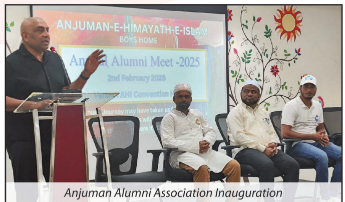
Anjuman Alumni Association Inauguration

Another significant milestone was the constitution of the Anjuman Alumni Association – Boys Home. The new association organized career guidance for the senior boys.