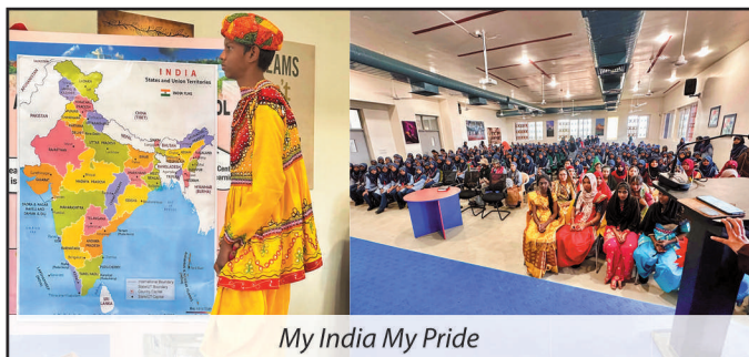
My India My Pride

In November, the Babson Entrepreneurial Program brought together schools, as students showcased innovative eco-projects like vermi composting, hydroponics, and IoT-based solutions. December opened with My Country My Pride, honouring India's heritage, followed by the Islamic and Deeniyyath competitions, fostering spiritual reflection.