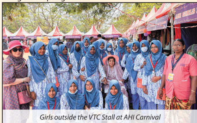
Girls outside the VTC Stall at AHI Carnival

Bakery session for Class XI demonstrated variations using basic sponge cake.