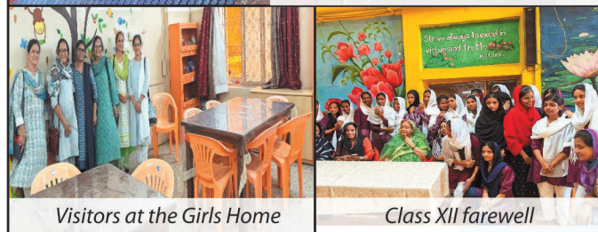
Visitors at the Girls Home