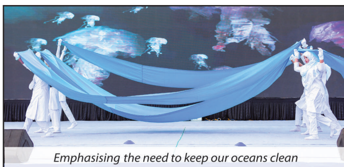
Emphasising the need to keep our oceans clean