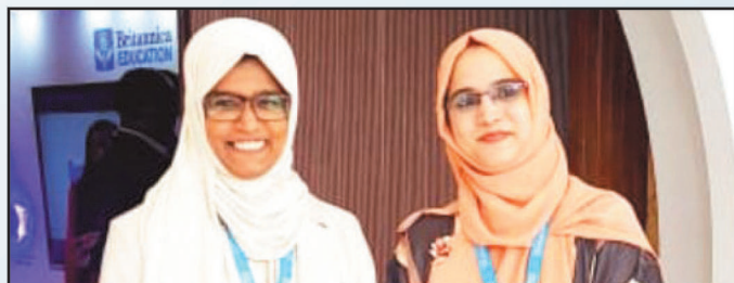
At the Britannica Education Global Indian Confluence

Al-Hira's unwavering commitment to educational excellence and also marking its inclusion into the Global Community for Collaborative Learning.