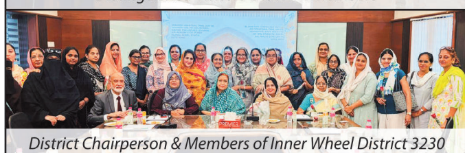
District Chairperson & Members of Inner Wheel District 3230