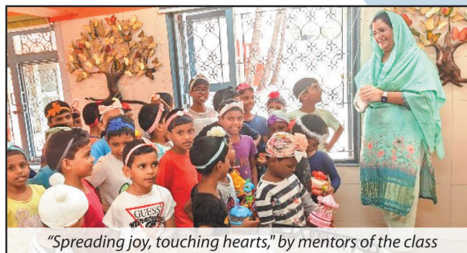
"Spreading joy, touching hearts," by mentors of the class