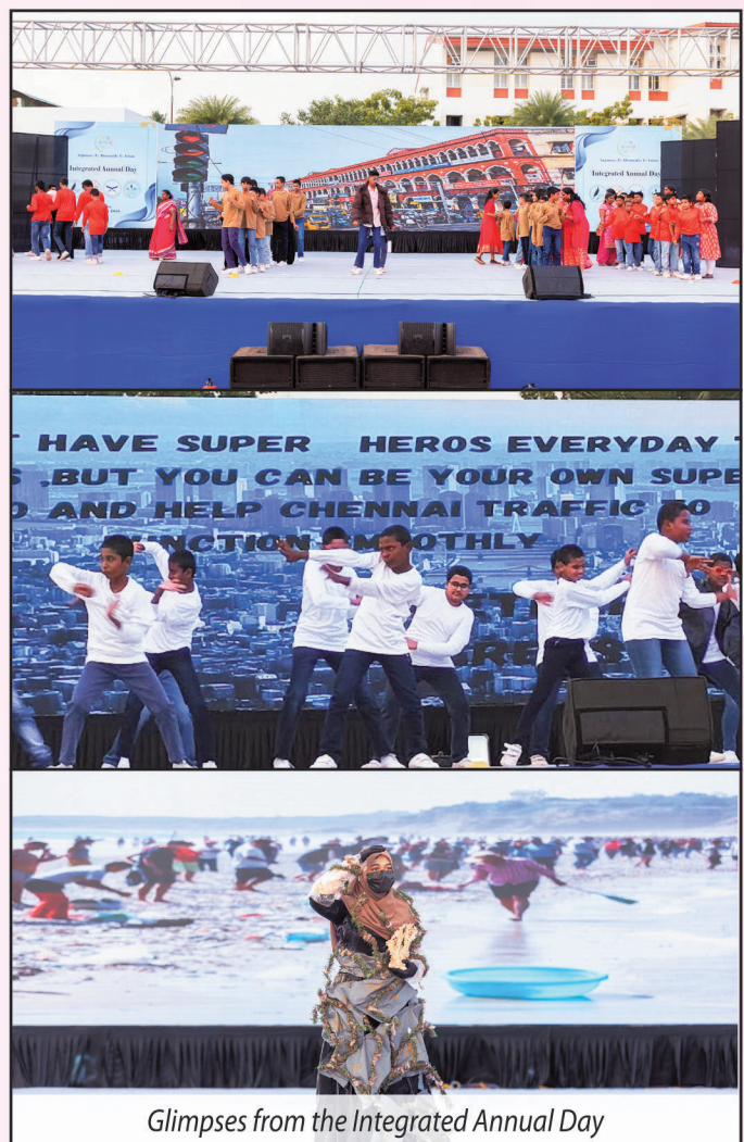
Glimpses from the Integrated Annual Day

Swirl 2 was a proud reminder of the talent, tradition, and teamwork that thrive at DACAL.