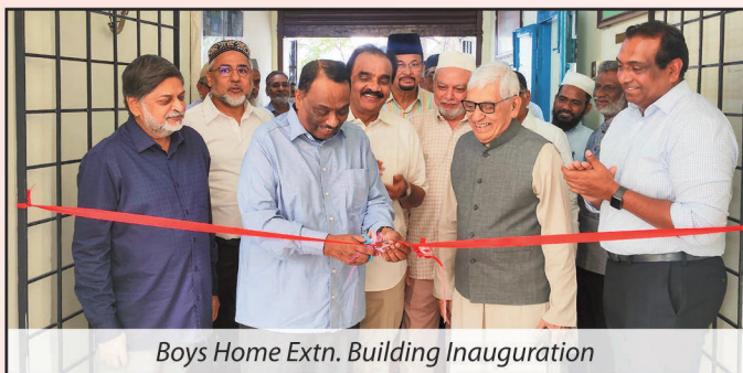
Boys Home Extn. Building Inauguration

Our impetus on holistic nurture and care remains constant. The Quran Recitation Program progressed in tandem with bayaans by esteemed scholars. The boys impressed during the annual Makhtab and the quiz conducted by The Afaf Way. The number of tutors was increased to six, with the teachers, wardens, and tutors working as a tightly integrated unit.